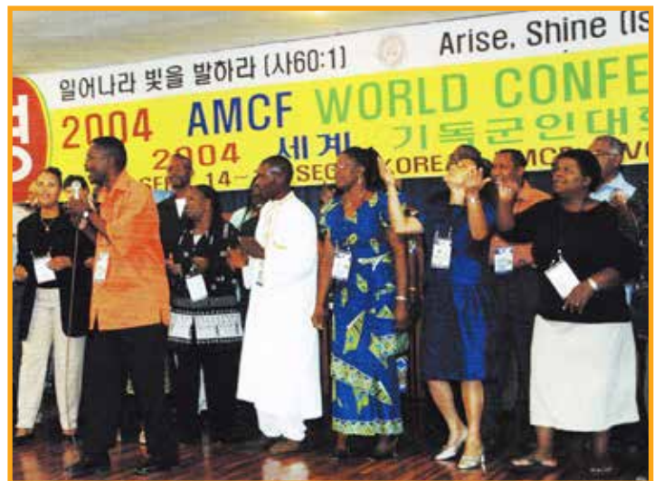
2004 AMCF World Conference

You can learn more about our ministry partner, the Association of Military Christian Fellowships (AMCF), at www.amcf-int.org . To learn more about the military Christian fellowship of Brazil, which will host the 2024 AMCF World Conference, visit umceb.com.br/site .