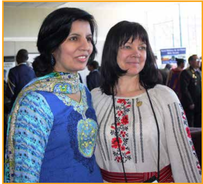
2014 AMCF World Conference