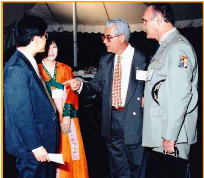
1994 AMCF World Conference