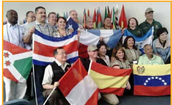
2014 AMCF World Conference