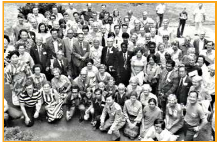
1976 AMCF World Conference