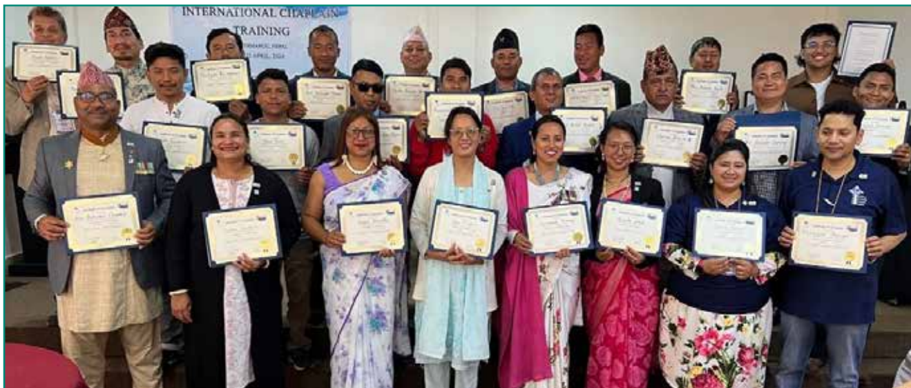
Nepal Chaplain Training

This newsletter contains ACCTS' annual report, a comprehensive look at how God is using our work to further His mission of salvation and redemption among the world's armed forces personnel. We invite you to take a few minutes out of your busy day to read about the transformative work God has been doing over the last twelve months, praising Him with us for all He is doing!