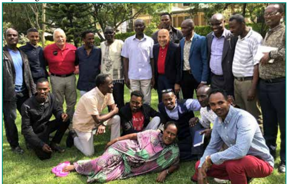
Ethiopian military Christian conference