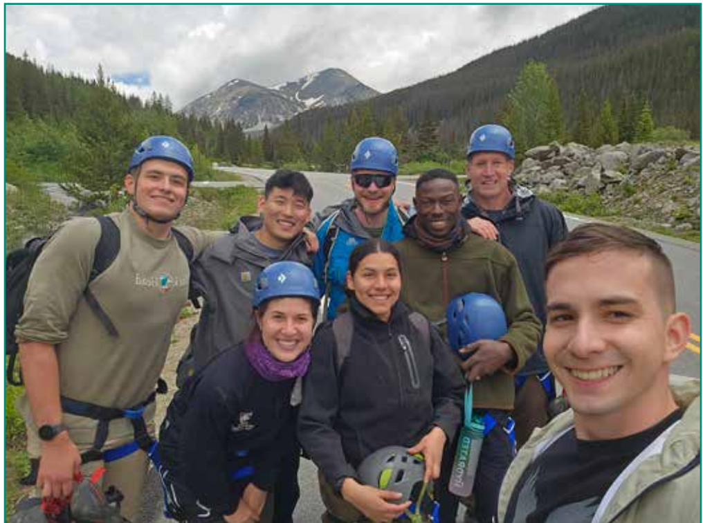
Interaction - Rocky Mountain High