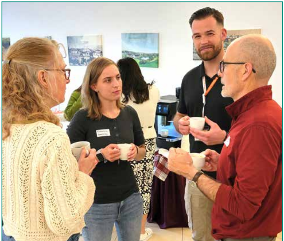
European Military Christian Meeting

My commandment, that you love one another as I have loved you. Greater love has no one than this, than to lay down one's life for his friends." This truth resonates deeply within military communities, where lifelong bonds of friendship and trust-based community are forged under intense circumstances. As an ACCTS staff we are committed to "Go...and make disciples" up close, where members of the international military community live, work, and play. In doing this, we have seen lives transformed and disciples equipped to shine Christ's light in even the